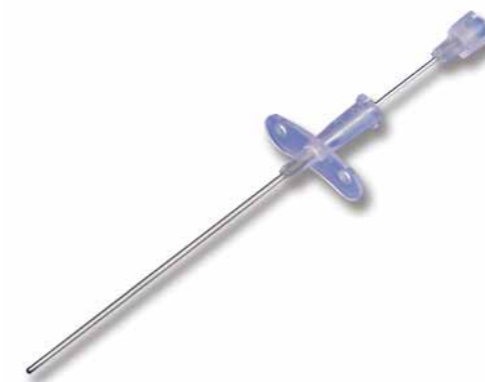
408273 Arterial Needle